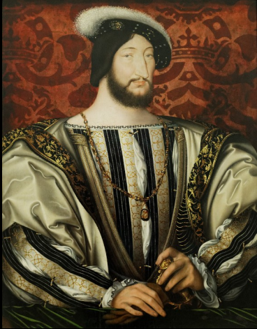
François Ier (1er)