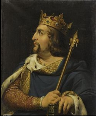
Louis VI (6)