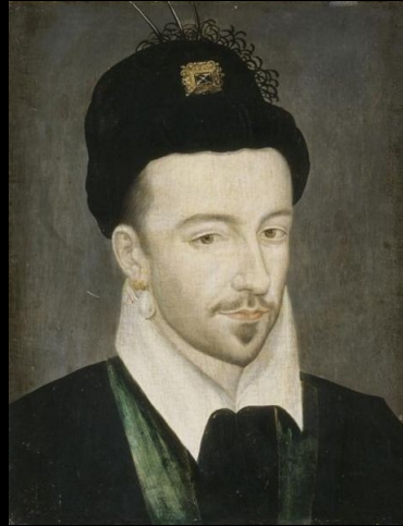
Henri III (3)