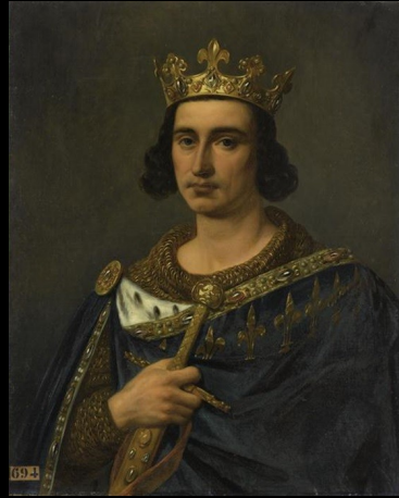
Louis IX (9)