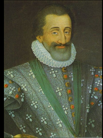
Henri IV (4)