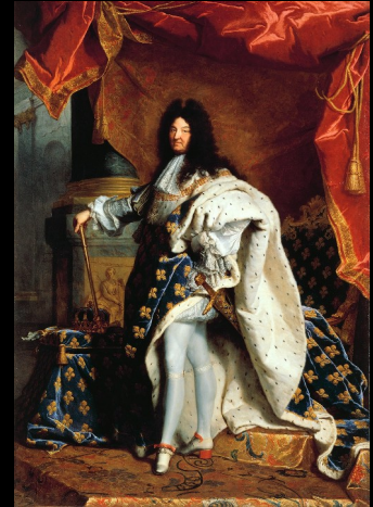
Louis XIV (14)